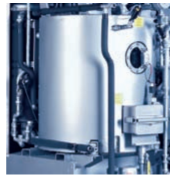
Highly efficient fractional still