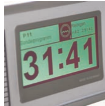
Easily viewed from a distance: the large-display remaining cycle time