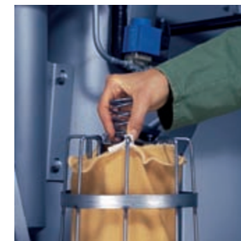
To be cleaned only once a day: the main lint filter

Cleaning intervals for the filters are unusually extended, due to the especially large main and matching secondary lint filters. The three standard tanks and water separator are self-cleaning. Optionally the machines are also available with a self-cleaning button trap.