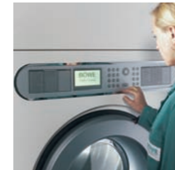
Easy-to-operate to the smallest detail

IMS - what does that mean? These are automatic maintenance programs, as well as two additional multi-maintenance programs, that bundle maintenance steps and intelligently have them run simultaneously. The machine shows when maintenance is required and certain maintenance cycles like e.g. filter maintenance are performed without any manual interference. However, you do not have to worry about losing control over your machine. The machine only provides suggestions, but you decide when maintenance is performed.