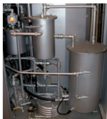
Avoids creation of odour: the multistep water separator

With BÖWE MultiSolvent® machines you can be sure of the best quality. Specially perfected process technology ensures the machines are optimally adjusted to all relevant solvents.