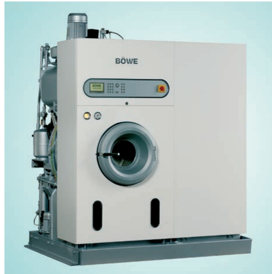
Classic elegant design for your shop