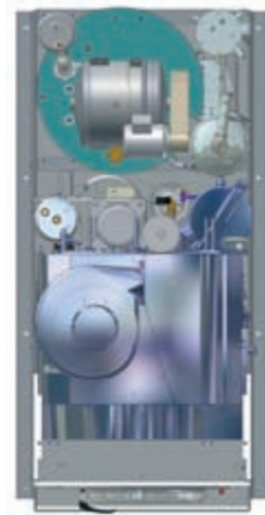
Slimline - The still is mounted behind the machine

When developing the P12, P15 and P18 we primarily had one issue in mind: the limited space in drycleaning shops. Both machines are available Slimline and Crossline therefore, these machines are available in the correct configuration for your shop. Just what you need for your shop a machine that will fit through your front door with the measurement now below 2.000 mm height.