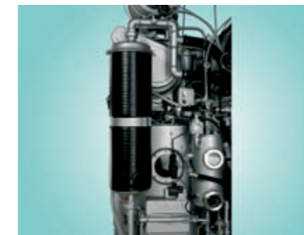
The SLIMSORBA surpasses the strictest environmental regulations

As an option to the standard equipment the fully integrated adsorption unit SLIMSORBA produces garments free of odor and an exceptionally low residual concentration of solvent. If needed, desorption can be started by fully automatic maintenance programs.