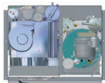
Crossline - Here, the still stands beside the machine